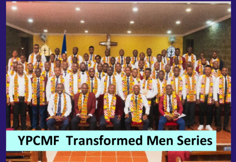
YPCMF Transformed Men Series