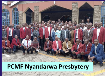
PCMF Nyandarwa Presbytery