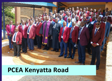
PCEA Kenyatta Road