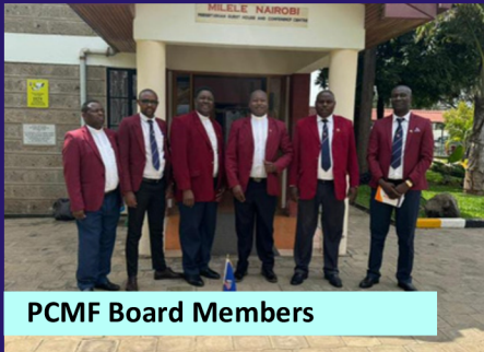
PCMF Board Members