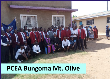
PCEA Bungoma Mt. Olive