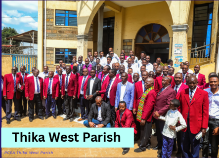
Thika West Parish