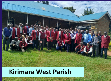
Kirimara West Parish