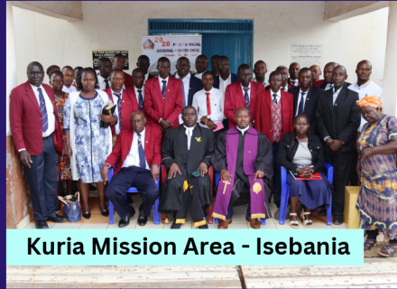
Kuria Mission Area - Isebania