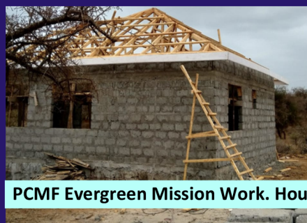
PCMF Evergreen Mission Work. House for Evangelist. Mashulu mission area