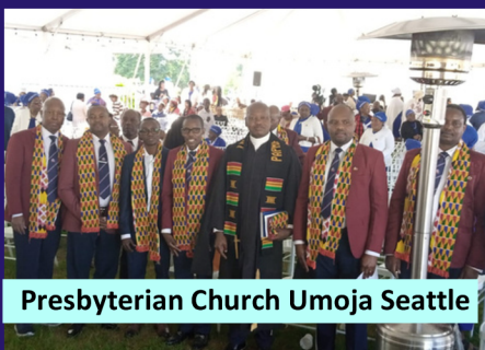
Presbyterian Church Umoja Seattle